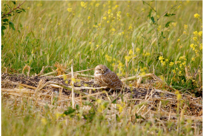
Burrowing Owl