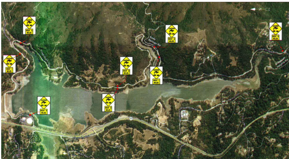
Newt Crossing Signs along Alma Bridge Road