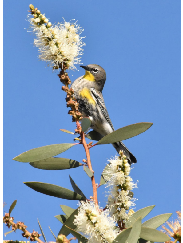
Yellow-rumped Warbler