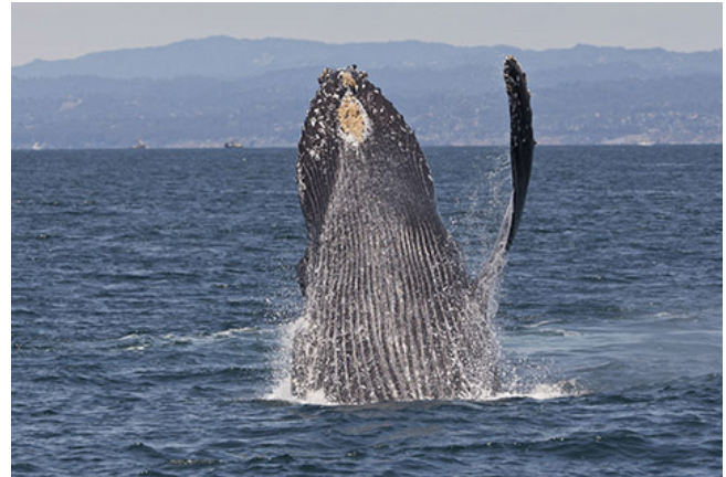
Humpback Whale

Description: Come explore one of the Sierra Nevada's summer birding jewels. On Day 1 we will explore the Yuba Pass area and on Day 2 we will explore Sierra Valley. For a list of potential birds, check the event description at scvas.org . Note: Rain or snow cancels, with refund.