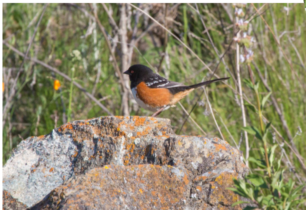
Spotted Towhee

For the entire roster of participating teams, check out scvas.org/birdathon - click "Team Descriptions/Registration."