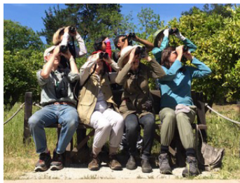
The Cupertino Creek Cruisers are continuing the tradition of cruising down Stevens Creek.