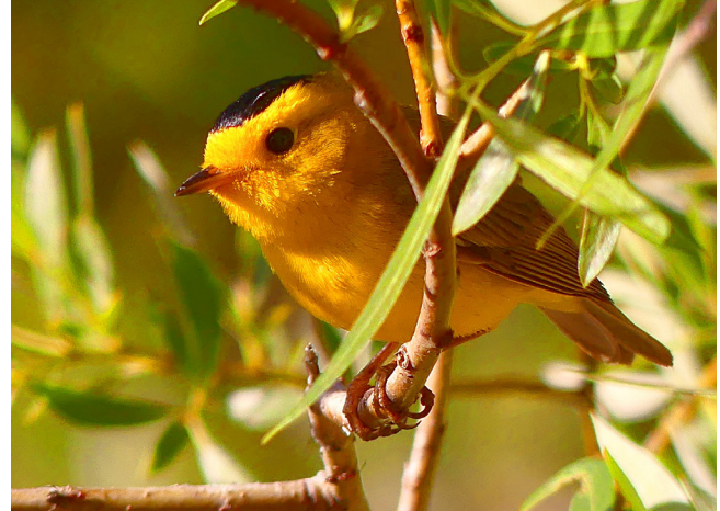
Wilson's Warbler