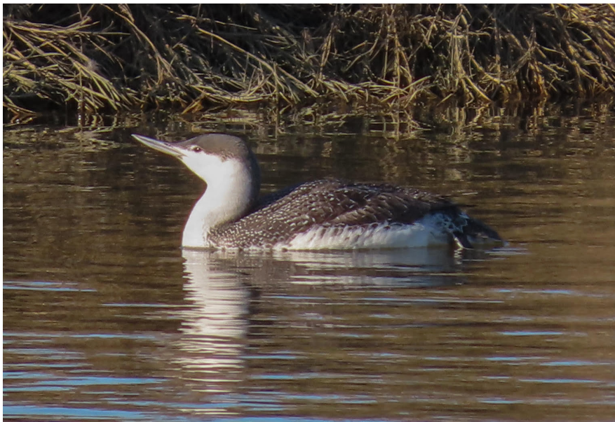
Red-throated Loon