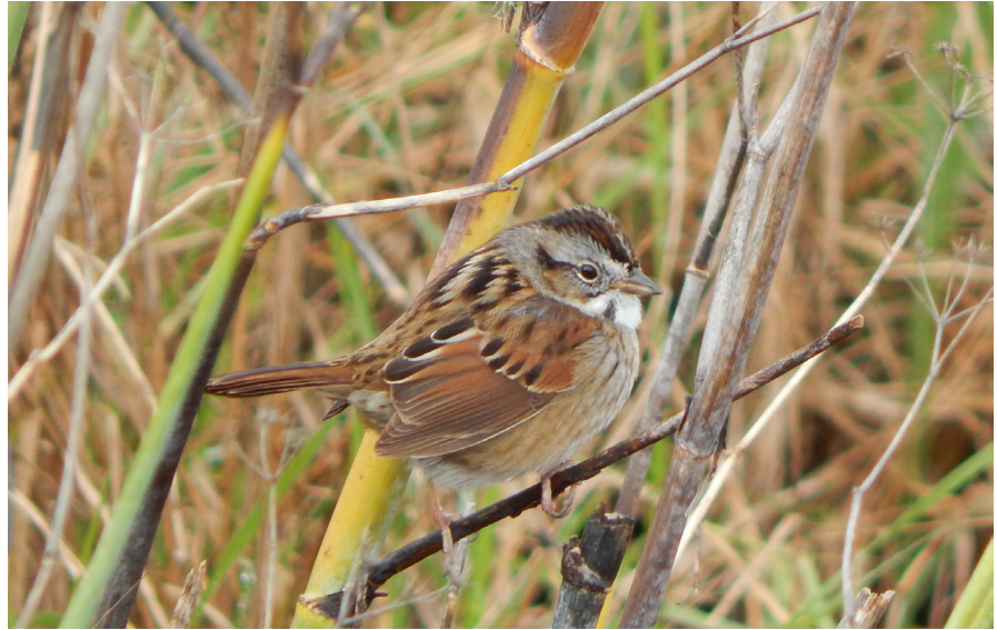
Swamp Sparrow