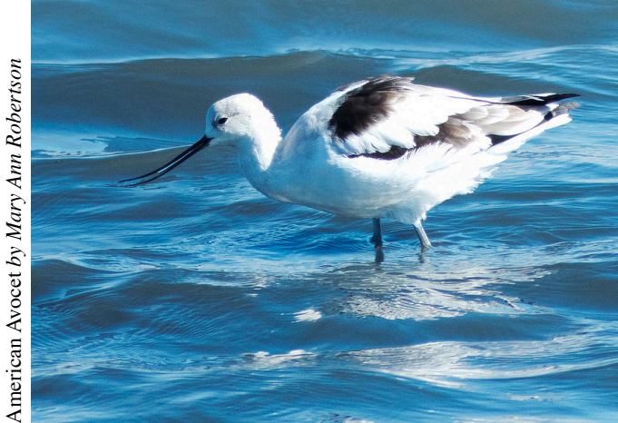
American Avocet

We are pleased to offer the following classes and excursions to our members and community. For full descriptions and more information, please visit our website at scvas.org or call the Office at (408) 252-3747.