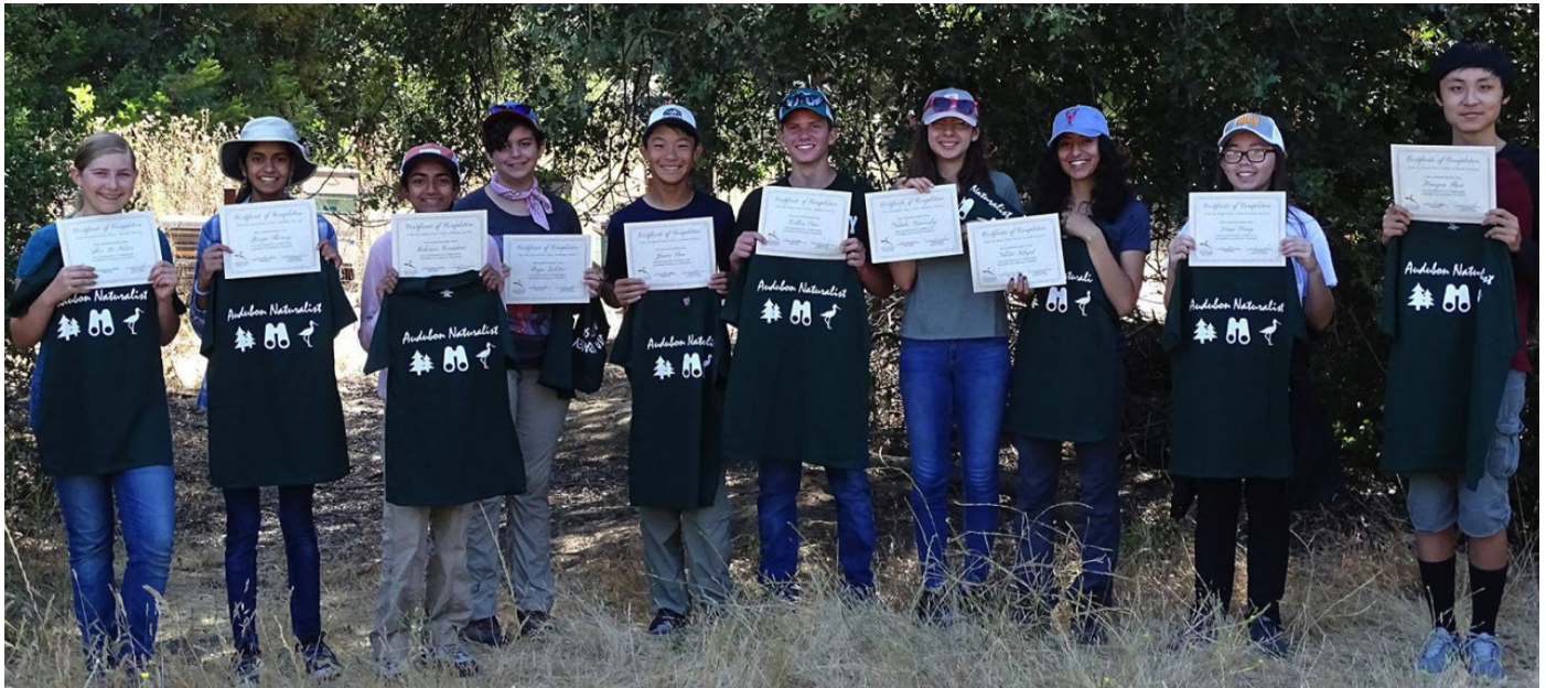
2018 Inaugural Class of Audubon Naturalists