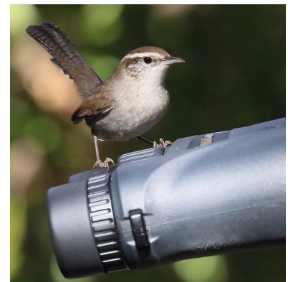
Bewick's Wren

*Organized by SCVAS and Los Gatos Birdwatcher*