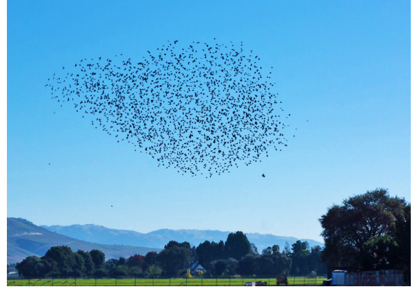
Murmuration over Coyote Valley

There is still a lot of work to do. We are currently engaged in a number of efforts to protect open space, creeks, birds and wildlife from habitat degradation and development: