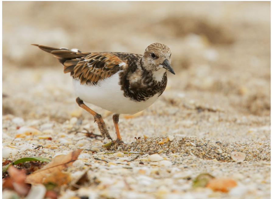
Ruddy Turnstone

was noted along the Calero Creek Trail on 10 Jul (HM); waxwings are rare in the summer in the county, though they have successfully nested at least once, in 2002. Phainopepla is another uncommon summer visitor to the Santa Clara Valley; one was at the Santa Clara Valley Water District in Almaden Valley on 1 Jul (AVe). An Audubon's Yellow-rumped Warbler along the Skyline Trail on 5 Jul was singing (WGB). Yellow-rumps nest at elevation along the western edge of the county in the Santa Cruz Mountains. A White-crowned Sparrow on 3 Jul at the Don Edwards NWR EEC was unusual given the date (WA). On 13 Jul, a White-crowned Sparrow found at the same location was missing its tail (DN). Lawrence's Goldfinches continued to be found at elevation on both sides of the Santa Clara Valley, with notable high counts of eight at Blue Oak Ranch Reserve on 8 Jun (DR) and nine at Loma Prieta on 15 Jul (RPh). At lower elevation, a pair were found in the foothills of the Santa Cruz range at the Stanford Dish on 2 Jun during the Palo Alto Summer Count (WP, GL, KON, SPz, GRy), and two were at Santa Teresa CP on 5 Jun (JRy).