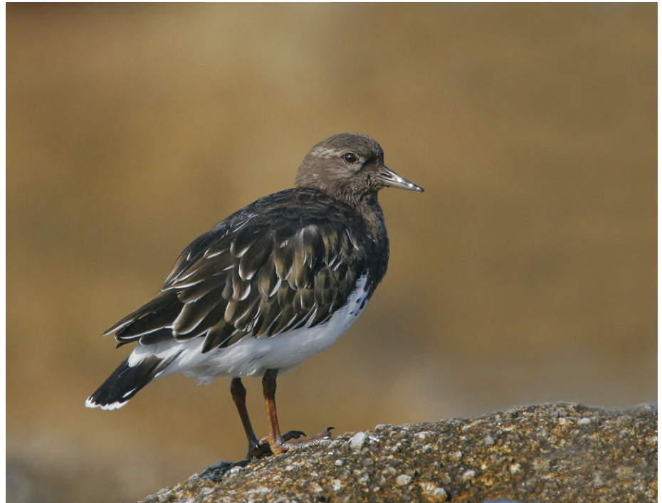
Black Turnstone

Only one Elegant Tern visited the county in July, staying at Pond A2E just long enough to be photographed on 26 Jul (LL). Peak counts occur between mid-August and the first week of November. Dispersing Least Terns , on the move following breeding further north in the bay, reached us on 13 Jul when one was spotted at Pond A2E (GL, RPh). The high count through the end of July was five, two adults and three young, on 25 Jul at the same location (WGB).