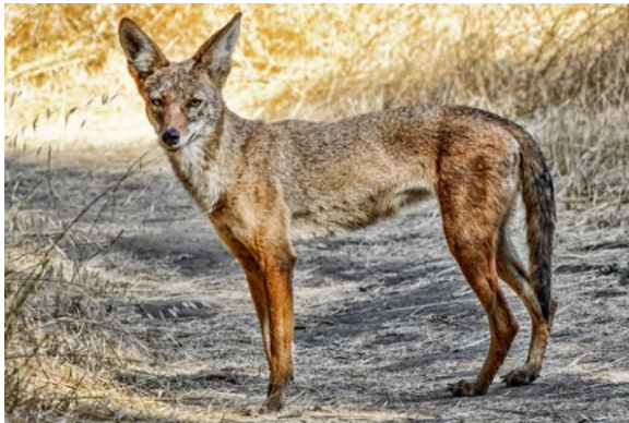
Coyote by Ralph Schardt

We are pleased to offer the following classes to our members and community. For more information, please call the Office at (408) 252-3747 or visit our website at scvas.org .