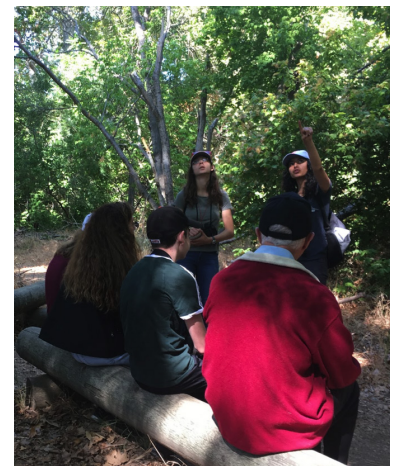
Day 7 - Graduation! Students led nature walks for their families and SCVAS docents