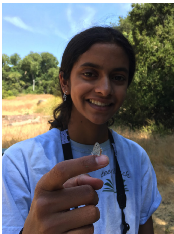
Day 4 - Insect ID with Grassroots Ecology