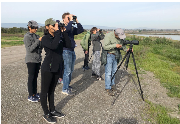
The Fledglings spread their wings and searched far and wide for new species during their Birdathon.