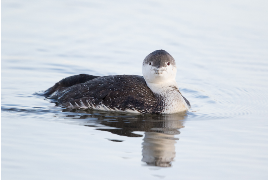
Red-throated Loon