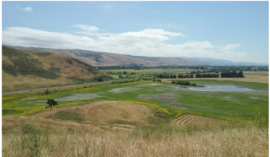
Coyote Valley

O n June 5th, San Jose voters will have the chance to say “no” to sprawl by voting NO on Measure B and YES on Measure C. Measure B, or the “Evergreen Senior Homes Initiative,” allows developers to circumvent environmental review for a 200-acre gated community in Evergreen while covertly facilitating residential sprawl into the habitat and open spaces of Coyote Valley. The initiative was crafted and funded by two billionaire developers hoping to bypass the normal planning process