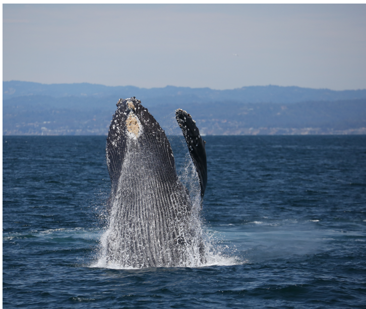
Humpback Whale