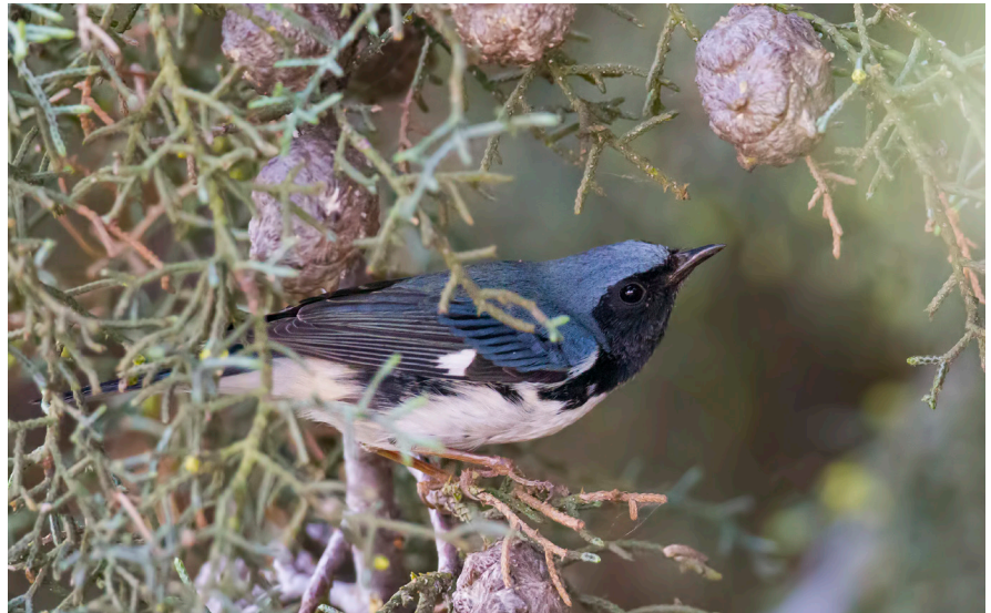
Black-throated Blue Warbler by Gail West

rows each winter are obviously different in appearance when compared to local populations. A Morphna type from the Pacific Northwest was found on 21 Oct along Guadalupe River below Trimble (SCR). The first Swamp Sparrow to arrive for winter was found along Adobe Creek on 14 Oct (TM) and seen again on 25 Nov (WBr). Another was found along Guadalupe River below Trimble on 21 Oct (SCR). The first White-throated Sparrow of fall arrived at Ulistac NA on 1 Oct (PDU). As many as three have been reported by several observers at that location, beginning on 4 Nov. Single Western Tanagers that might stay over winter were noted in the Willow Glen neighborhood on 22 Nov (BM) and along Guadalupe River in downtown San Jose on 30 Nov (KG). A dapper Rose-breasted Grosbeak was attracted to a yard in San Jose with feeders and a bird bath on 5 Oct (JMo). They are found in the county about three years in every five. A Bobolink was an excellent find in the dry lakebed of Lake Lagunita on 2 Oct (RFu). It was the first in the county since fall of 2011. All save one of the previous fifteen recorded have been seen for only one day. A Bullock's Oriole was found along the bay-side riparian section of Adobe Creek on 25 Oct (WGB). While most Bullock's Orioles head south for winter, a few do overwinter. A single Evening Grosbeak visited Lick Observatory on Mount Hamilton on 27 Oct (EGa). The irrup-