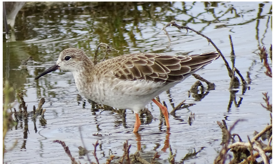
Ruff

communications Hill in San Jose on 6 Nov (RSh). Lewis's Woodpeckers are resident in San Antonio Valley, and also occur in other parts of the county in some winters. Three to four have been seen at Chesbro Reservoir beginning on 21 Oct (JPa) and continuing through November (m. ob.). While the majority of our wintering sapsuckers are Red-breasted Sapsuckers, Red-naped, Yellow-bellied, and various hybrid sapsuckers do occur. A Red-naped Sapsucker was found in Santa Clara on 24 Nov (CVR), another was found in Morgan Hill on 26 Nov (SCR), and a Yellow-bellied Sapsucker was noted in the Hunting Hollow portion of Henry Coe SP on 6 Nov (NS). Yellow-shafted Flickers , found here only in winter, were found at three locations. One was along Guadalupe River below Trimble on 21 Oct (SCR), one in Los Gatos beginning on 20 Oct (KB), and one at Ulistac NA beginning on 4 Nov (SJ, PB). A Pileated Woodpecker in Henry Coe SP in the Diablo Mountains on 3 Oct was outside the woodpecker's known breeding range, which maps further west in the Santa Cruz Mountains (JY, AL).