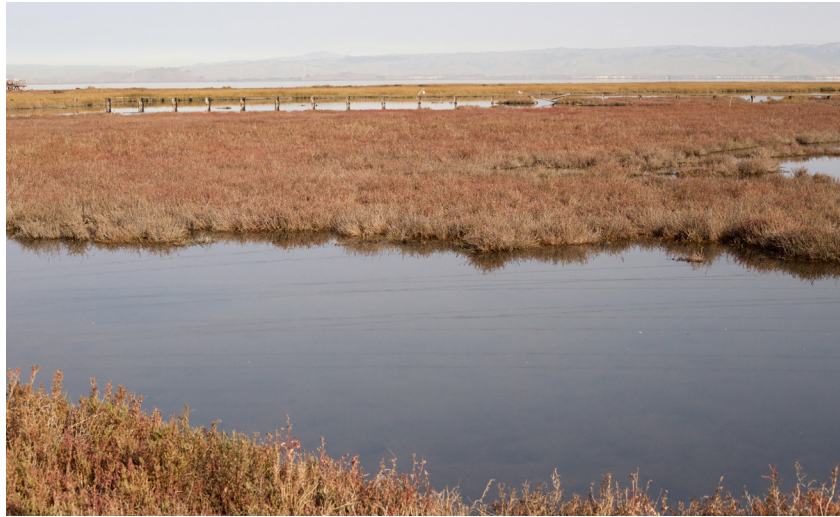
Palo Alto Baylands

head, we are wary of new dams, the potential for contamination of Pacheco Creek and the Pajaro watershed with invasive species, and whether environmental benefits will be guaranteed. We outlined our concerns in comments on the Initial Study and Notice of Preparation, and also attended a working group meeting for the project. We will continue to be involved.