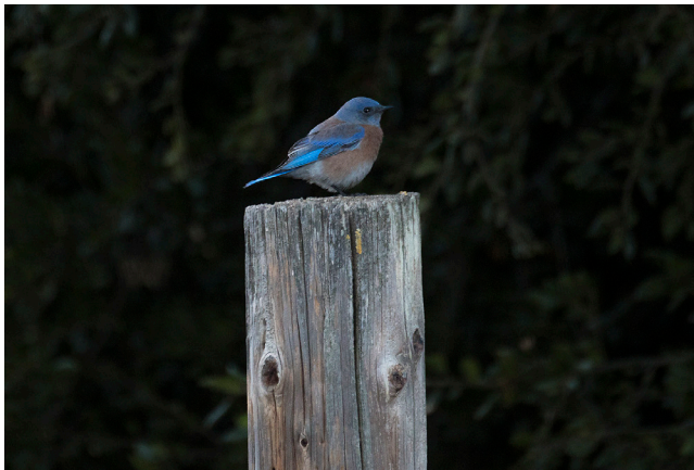
Western Bluebird

Dates: Tuesday, January 16 and February 20