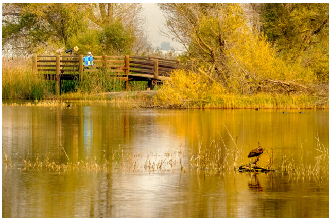
Merced NWR