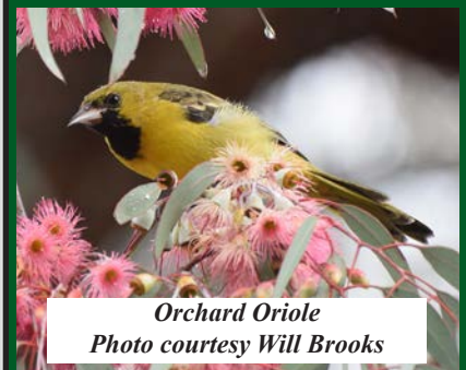
Orchard Oriole

CBC Parties Find Some Winter Gems - Including Red Crossbills and an Orchard Oriole!