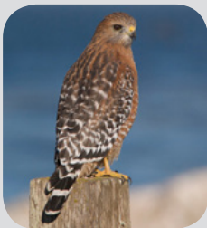
Left: Red-shouldered Hawk; Right: "Filling the Tub"