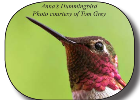
Anna's Hummingbird

This course is for anyone interested in birds but feels like they lack basic bird identification skills. We'll start by studying birds in backyard settings, at local parks and in local nature preserves to learn how to identify them based on body type, size, color, identification clues, habitat and behavior. We'll learn a systematic approach to gathering information about a bird you have seen that will help you find it later in a field guide. Topics will include choosing and using binoculars, using field guides, identifying bird groups, identification clues, body part identification, habitats, behavior and field marks. We will also discuss reference materials, books, magazines, other local organizations and internet sites to help you more fully enjoy our local avian population.