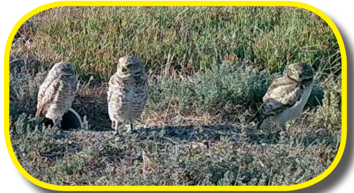
A successful Burrowing Owl family at the Regional Wastewater Facility

Together we have proven that challenges can be overcome and that it's still possible for the Burrowing Owl to once again be a common sight, and entertain future generations.