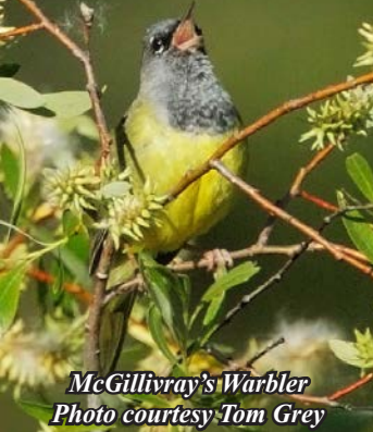
McGillivray's Warbler

A rare breeding McGillivray's Warbler was one of the highlights of the summer.