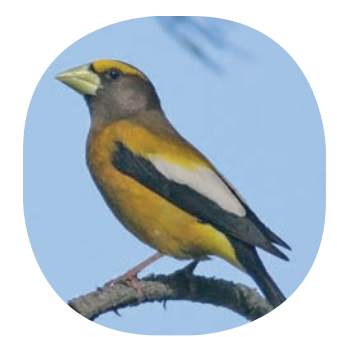
Evening Grosbeak

An immature Chestnut-sided Warbler was found along Thompson Creek on 20 Jan (GM) and was seen again on 23 Jan (AMcD) but not after that. Interestingly, three of our now ten records have occurred in this winter period. ABlack-throated Gray Warbler along Coyote Creek on the Calero-Morgan Hill CBC on 26 Dec (fide AV) was the only one found this winter. A Palm Warbler was seen at the end of Embarcadero Way in Palo Alto on 20 Dec (MMR) and has remained there at least until 12 Jan (m.ob.). Two Palm Warblers were found along Richmond Avenue in the Coyote Valley on 26 Dec (RPh et al.) and at least one of these birds has been seen through 16 Jan (m.ob.). The Northern Waterthrush wintering in the Charleston Road marsh was heard on 20 Dec (MJM) and was seen there on 1 Jan (MMR, MJM). Three to six Chipping Sparrows have been seen irregularly at Jeffrey Fontana Park 23 Dec-3 Jan (JPa). This is the fourth winter that birds have been found there. Two Grasshopper Sparrows were found along Coyote Ridge on 26 Dec (SCR), a place where a few birds are found in most winters. A Swamp Sparrow was seen at the Ogier Avenue ponds on 4 Dec (SCR) and another was there on 29 Jan (MDo et al.). One was also found along Alviso Slough on 19 Dec (SCR). Fifteen White-throated Sparrows were seen during the period, only two were at