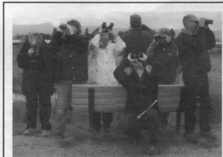
The Education Committee's Birdathon Team, "The Wrong Terns," helps to raise money for SCVAS' programs each year while having an awful lot of fun, too! This is just one of the many teams you could choose to support or sponsor.