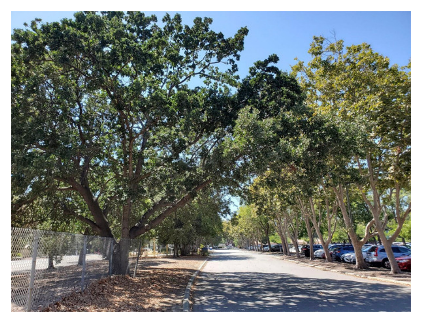
Above: These trees slated to be removed to make room for a sidewalk!