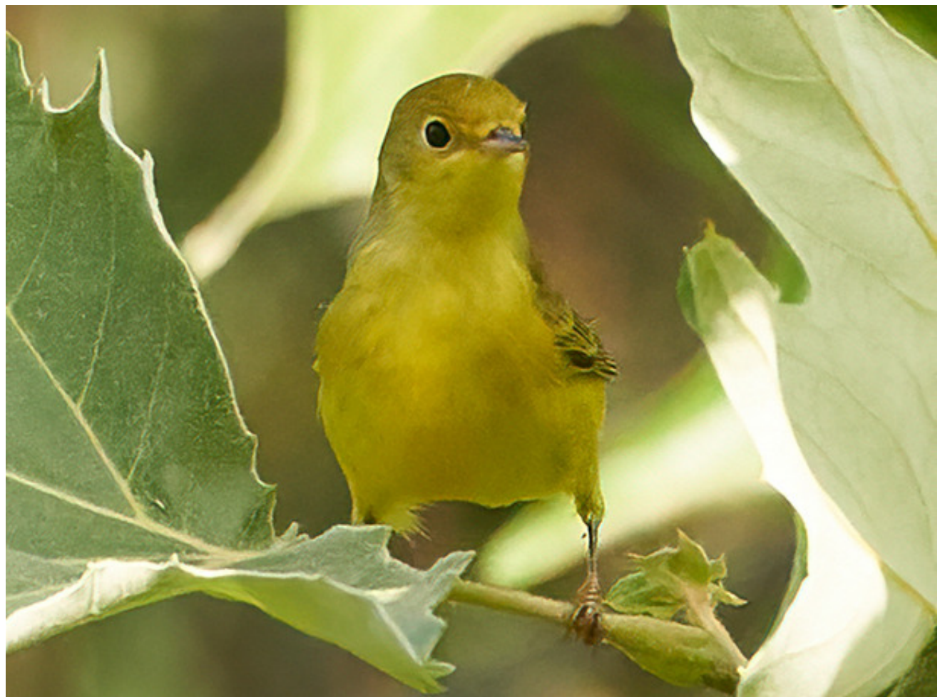
Yellow Warbler: Brooke Miller