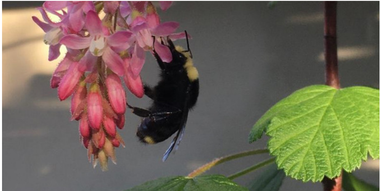
Red Flowering Currant (Ribes sanguineum) and Yellow-faced Bumblebee: Ann Hepenstal