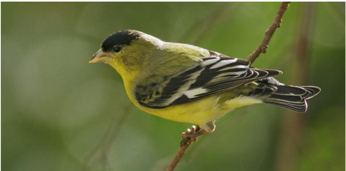
Lesser Goldfinch: Tom Grey