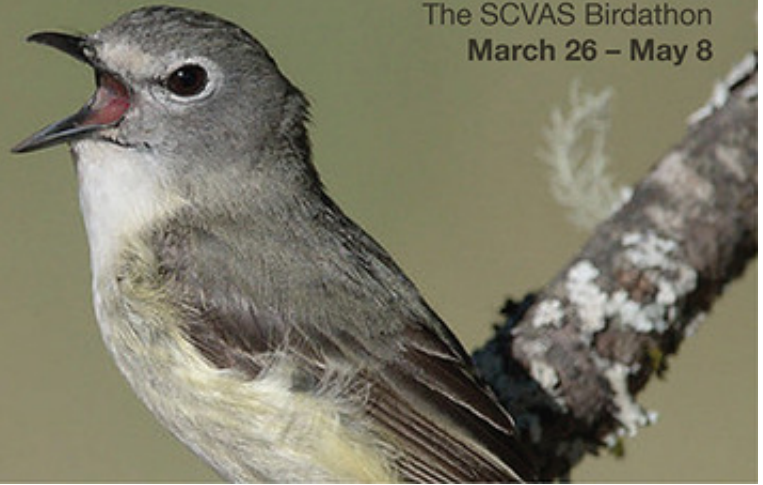
Cassin's Vireo.

Birdathon Kickoff March 16, 7:00 PM (via zoom) with special guest Freya McGregor of Birdability