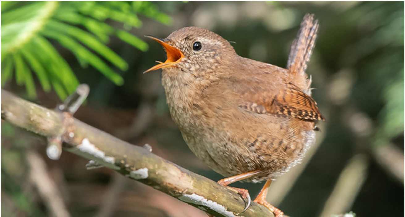
Pacific Wren: Corey Raffle