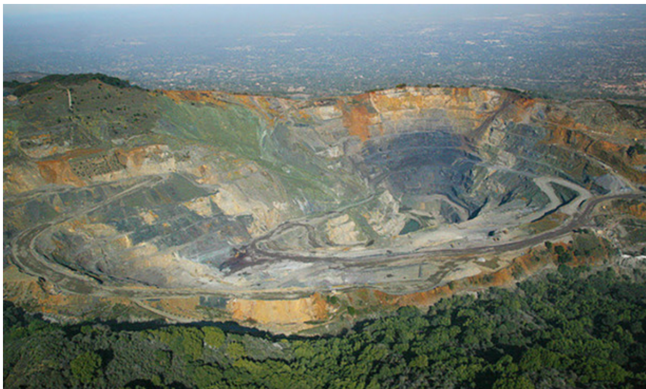
Lehigh Quarry and Cement Plant.