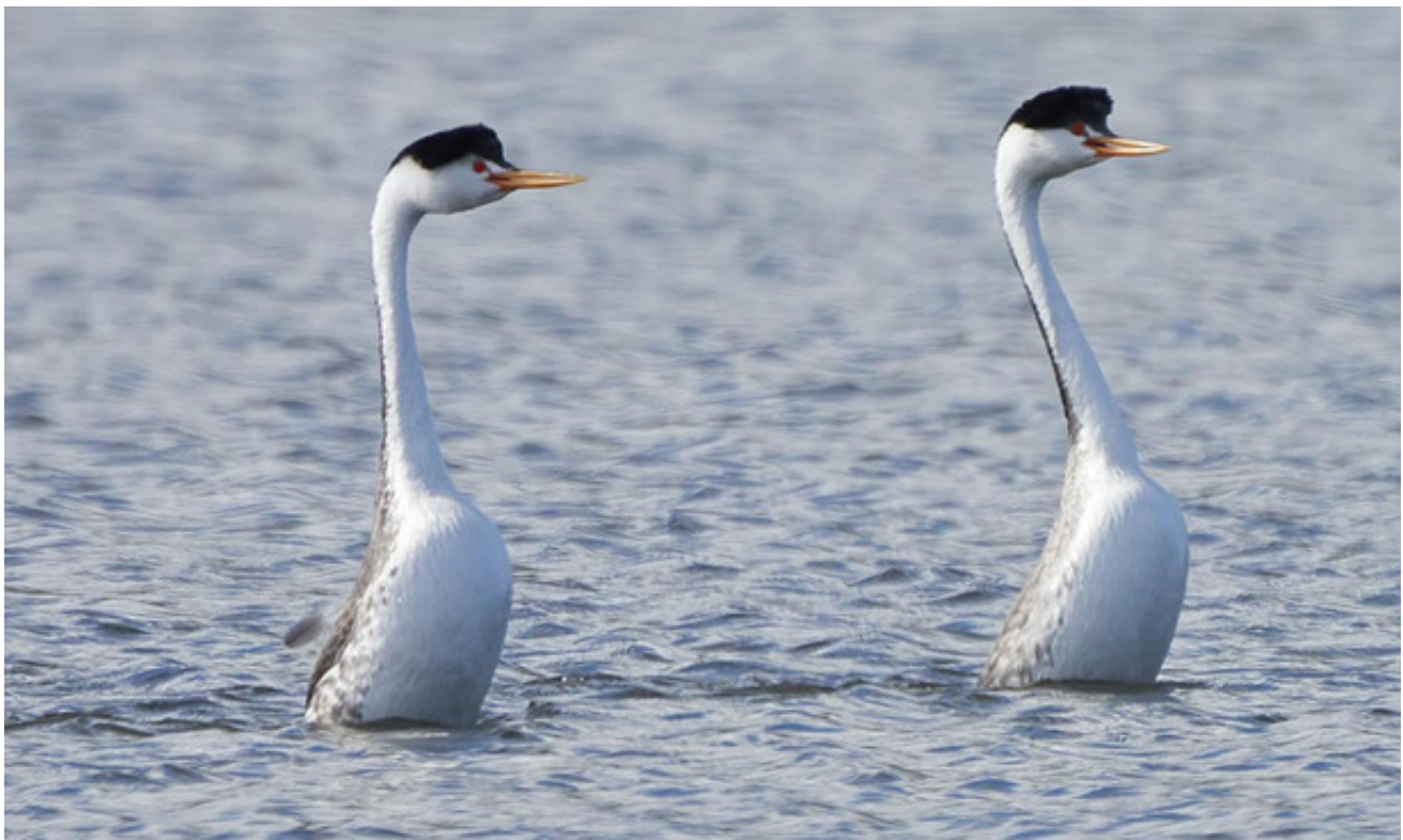
Clark's Grebes