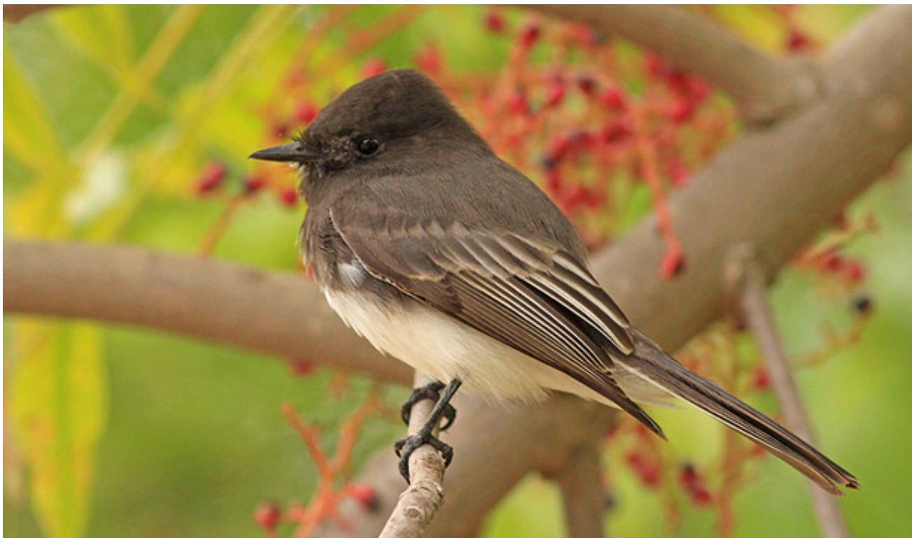
Black Phoebe: Chris Johnson

Winter birds are here! Find out what birds our members and friends have seen lately , and brush up on your " crowned sparrow " ID, in the latest All Around Town .