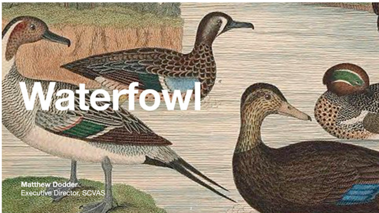
Waterfowl illustration by Alexander Wilson